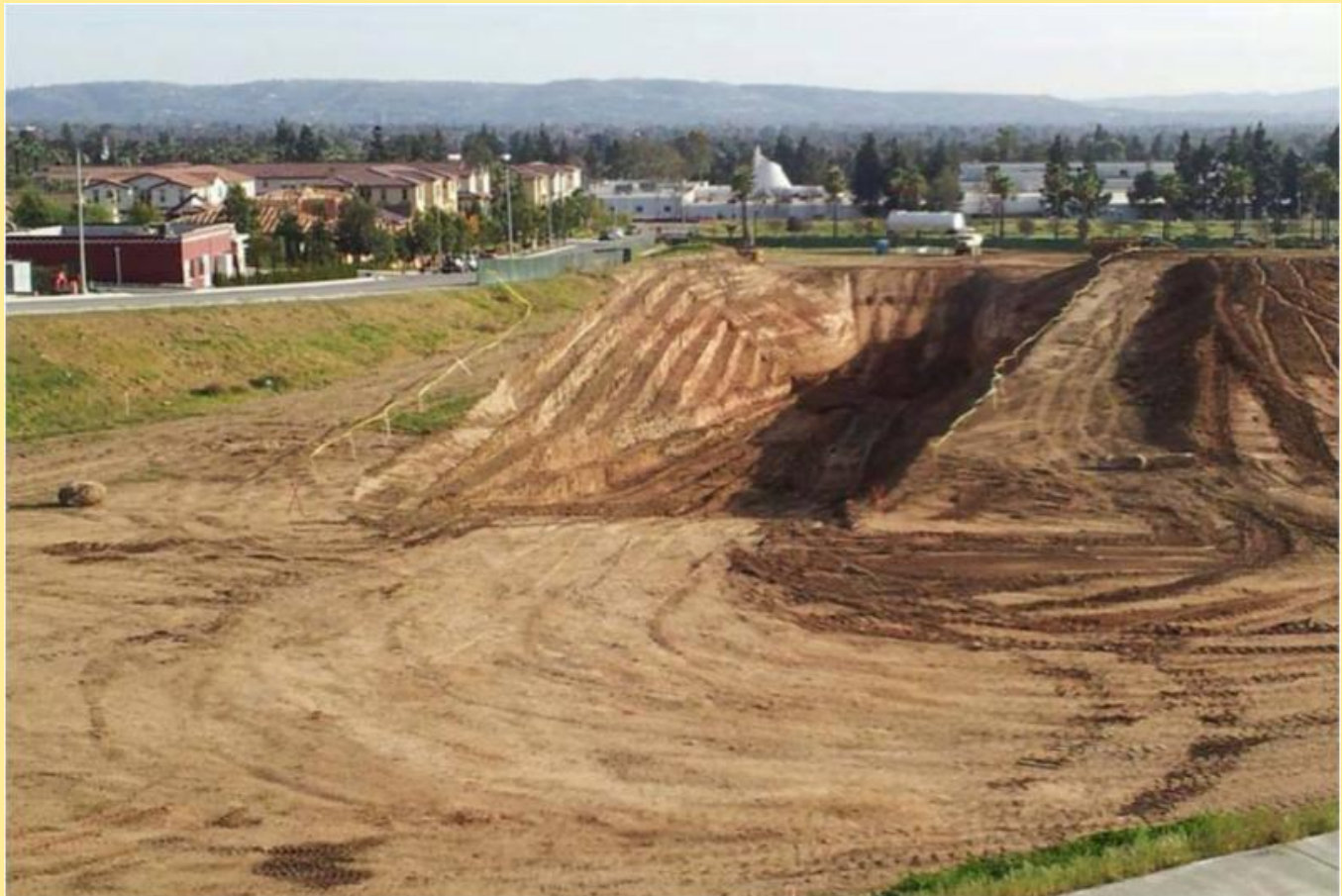
Presentation on Trenching to the Committee