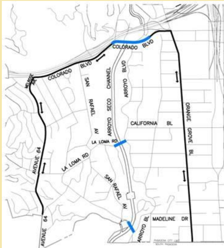
Local Access Map: